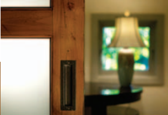
Before and after changes were startling in the makeover of a residence at 121 Hyman Ave.